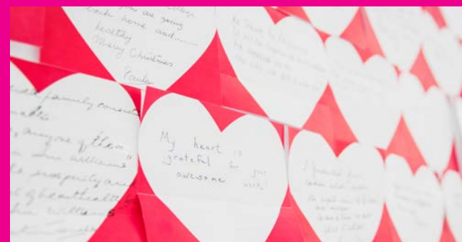
Your heartfelt messages of encouragement to WCH Cardiac Rehab patients

From the bottom of our hearts, thank you so much! We're so grateful for you.